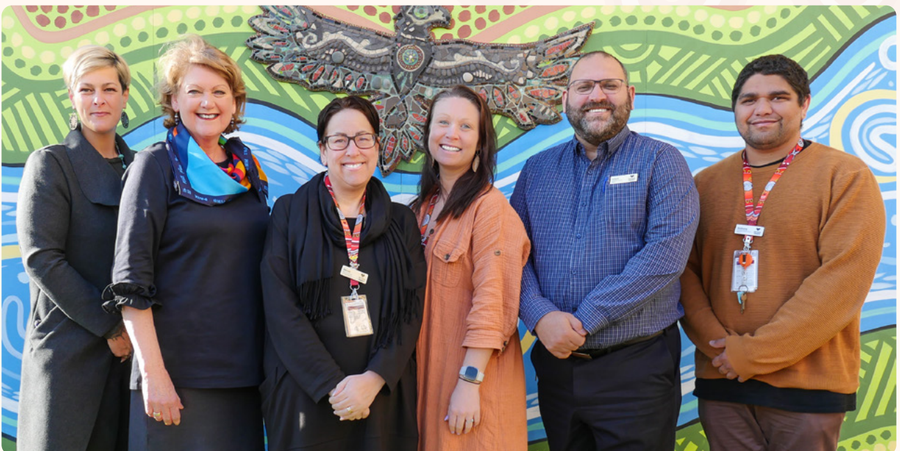
Above: The Aboriginal Health Unit team, June 2023

During 2023, a consultation will be undertaken with both internal and external stakeholders to gain reflections on the previous AEP (2016-2020).